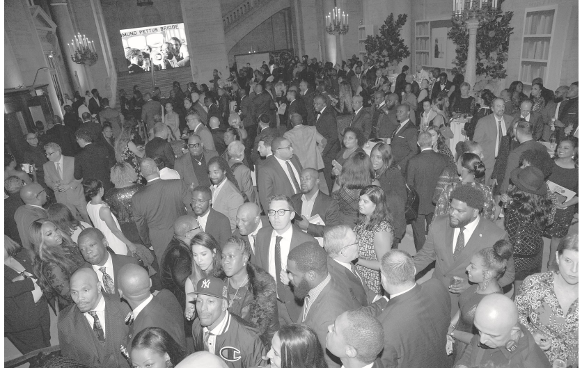
Atmosphere: The Celebration and Party with a Cause took place at The New York City Public Library in the Stephen A. Schwarzman building