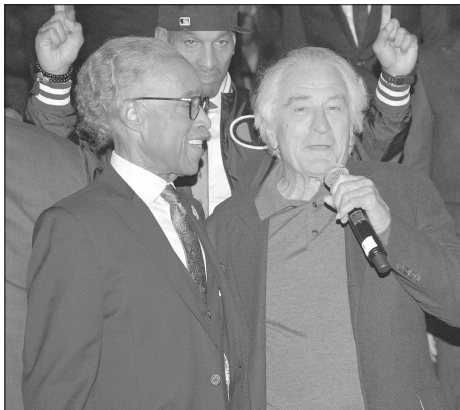
Robert DeNiro, Rev. Al Sharpton