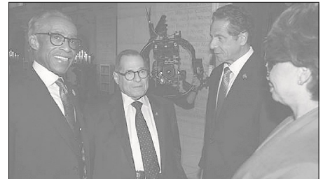
Rev. Al Sharpton, Congressman Jerrold Nadler (D-NY), NY Governor Andrew Cuomo and Former Senior Advisor to President Barack Obama, Valerie Jarrett