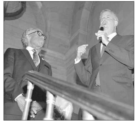
Mayor Bill de Blasio toasts Rev. Sharpton